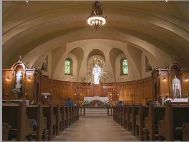
House of Worship