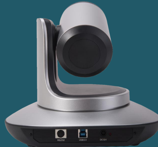
Back of TLC-300-U3-12